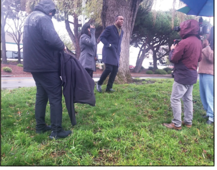
(Good Morning America film crew at Corefact Russell City/Hayward, CA.)

of a redevelopment plan that entailed the relocation of Russell City residents and businesses for industrial development. On November 16, 2021, the Hayward City Council voted unanimously to issue a formal apology for the City's past actions. In January 2023, the Good Morning America morning show sent a crew to film a segment about the city's history featuring a